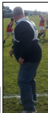
Checking his handy work