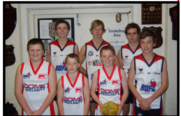
Romsey's RDFL Interleague Representatives