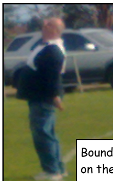
Boundary man on the run